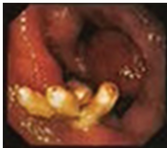
Figure 2: Relook endoscopy shows a large hematoma in the second part of duodenum with complete luminal narrowing. Also seen are the hemoclips in situ