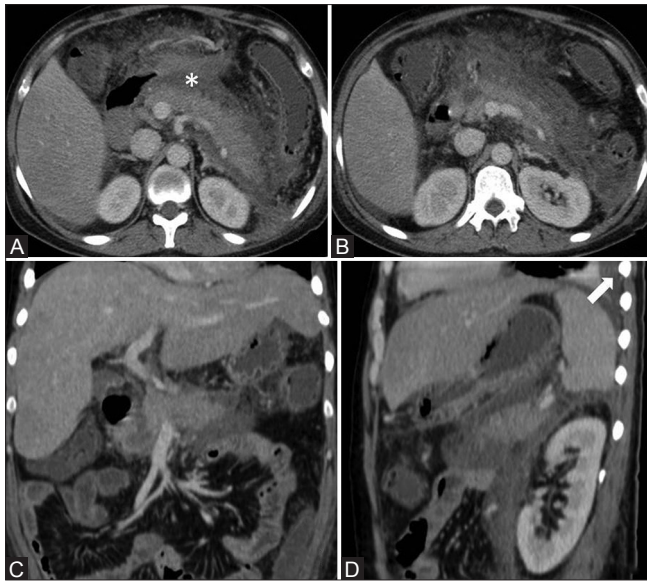
Figure 1 (A-D): A 34-year-old alcoholic male with acute pancreatitis and persistent organ failure. Contrast-enhanced CT (Day 7) [axial (A and B), coronal (C), sagittal (D)] images show pancreatic necrosis <30%, acute necrotic collection (asterisk), and left pleural effusion (arrow). CTSI score was 6 (discordant) and MCTSI score was 8 (concordant with RAC grading)

both CTSI and MCTSI showed good concordance with severity grading as per the RAC, with MCTSI performing a little better (although this difference was not statistically significant). This is similar to the results of a recent study by Raghuvanshi et al. [24] Compared with the study by Bollen et al. , a greater proportion of our cases had OF. This is likely because a higher percentage of our cases belonged to the severe and moderately severe categories of AP.