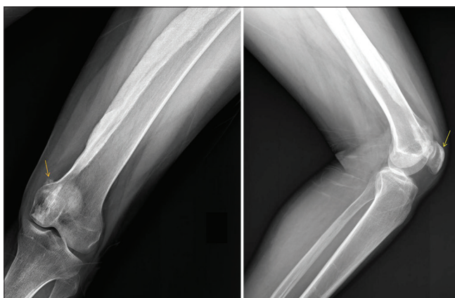
Figure 1: AP and lateral radiographs of left knee and femur show flowing “candle wax” like ossification along medial cortex of femur. A small focus of soft tissue calcification is seen on the AP radiograph medially adjacent to the patella (orange arrow). The lateral radiograph shows few foci of sclerosis within the patella (yellow arrow)

On imaging, differential diagnosis of melorheostosis involves myositis ossificans, chronic osteomyelitis,