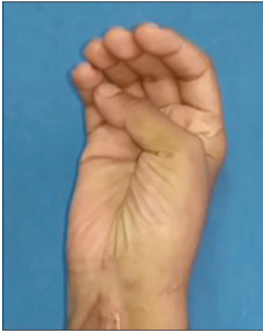
Figure 7: Kapandji score 10 at 1 year