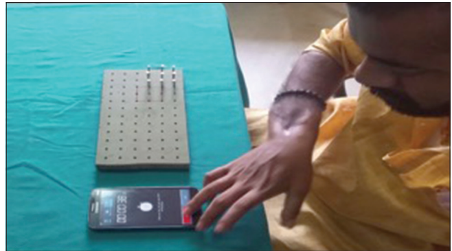
Figure 6: Nine hole peg test

recovery), the grip dynamometer and the Medical research council muscle power grading system. [8] [Figure 4]