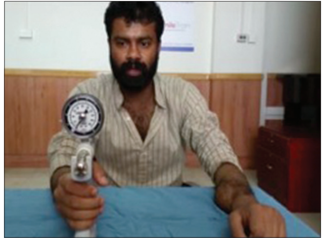
Figure 4: Strength testing with dynamometer at 1 year