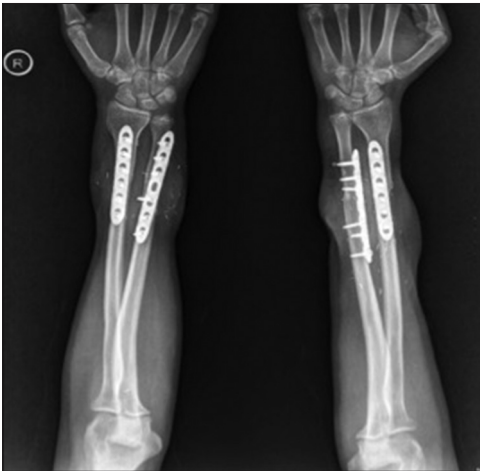
Figure 8: Bone healing 1 year post-transplant