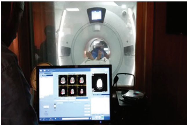
Figure 9: Functional magnetic resonance imaging showing cortical integration at 1 year