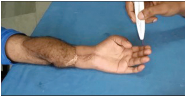
Figure 5: Monofilament testing