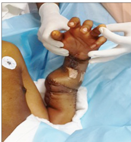
Figure 1: Passive physiotherapy given from second post-operative day

The same protocol was used for both the patients. The patients were given intense physical and occupational therapy for 5 h a day for 1 year. This was done in two sessions of 2½ h each every day. In the first 2 weeks, the aim was to prevent hand swelling and to prevent joint stiffness and to promote tendon gliding. This was achieved by hand elevation and by passively extending the fingers with wrist flexion and by passively flexing the fingers with wrist extension [Figure 1]. Controlled active motion of fingers and wrist was encouraged from the 2 nd post-operative day onwards. At other times, the hand was immobilised in a wrist extension splint.