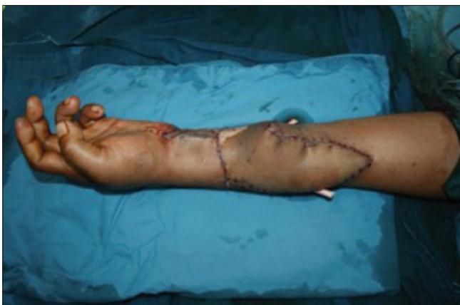
Figure 13: After resurfacing the defect with anterolateral thigh flap

in India considering the prevalence of CMV which is 80%–90%, and the scarcity of donors for hand transplant, it will be difficult task to get a negative donor if the recipient is also negative for CMV. Both of our patients were treated with prophylactic antiviral therapy with Ganciclovir.