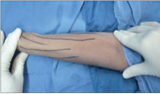
Figure 7: Marking of superficial veins