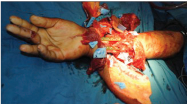
Figure 9: Bone fixation with 3.5 mm locking compression plate

hand. Hence, the ulnar artery had to be anastomosed immediately, which re-established the vascularity of the limb. In our second case, on the left hand, the ulnar artery was anastomosed first to avoid a similar situation.