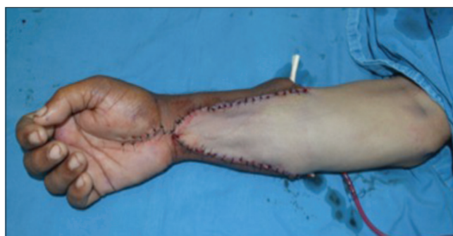
Figure 10: Appearance after final closure

The first transplantation lasted for 17 h and the second for 16 h [Table 7]. The intraoperative period was uneventful in both the patients except for the blood loss and need for volume replacement. The first patient was transfused with 5 units of blood and the second patient with 4 units of blood intraoperatively. Both the patients also received 3 units and 2 units, respectively, in their post-operative period. Post-operatively, they were shifted to the transplant ICU and electively extubated. In the first case, the ulnar skin flap of the left hand which had shown some intra-operative congestion started to show signs of congestion within the first 48 h [Figure 11]. It was decided that immediate debridement of the devitalised tissue and providing a cover for the same would be more prudent on account of the risk of infection an potential life-threatening sepsis in an already immune-suppressed patient. The patient was then taken up for excision of the devitalised tissue [Figure 12]. Moreover, re-surfacing of the raw area with an anterolateral thigh flap [Figure 13] under regional anaesthesia as the patient was just recovering from a major procedure under general anaesthesia. The anastomosis of the flap was done in the end to side