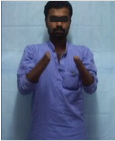
Figure 1: Pre-operative photograph of our bilateral first hand transplant patient