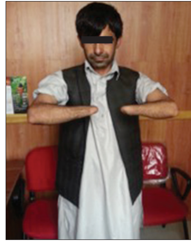
Figure 2: Second bilateral hand transplant patient before the procedure