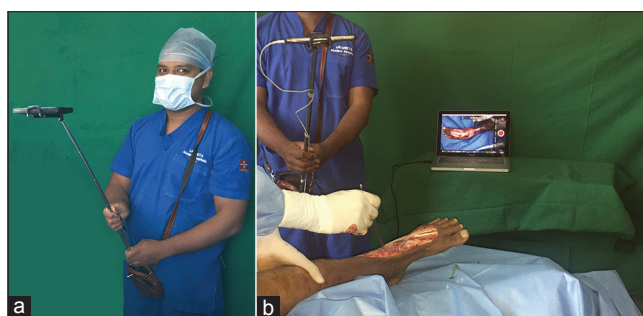
Figure 2: (a) Three-point stabilisation system, (b) live recording using iPhone and selfie stick