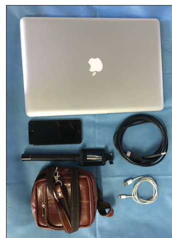
Figure 1: Mac Book Pro, iPhone, hip bag, selfie stick, Lightning cable, USB cable

Since the screen might not be facing the recording person, overhead operative light might make it difficult