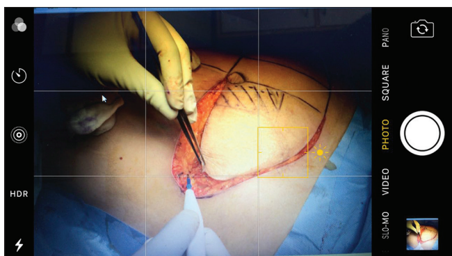
Figure 4: Screenshot showing camera interface for brightness adjustment

The iPhone can be connected to a laptop (a Mac with Yosemite) through a USB cable/Lightning cable, and the recordings can be viewed live on the laptop screen.