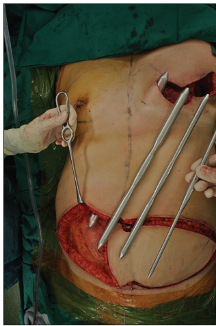
Figure 2: The set of Dilon Luz vascular dilation wands with increasing caliber. The smallest is used to begin the tunnelling process while the largest wand is used to create adequate detachment for the safe passage of the flap. Wand diameters used range from 6 to 20 mm