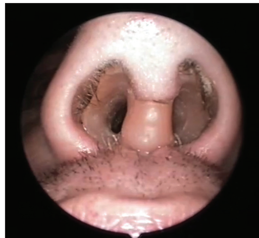
Figure 2: Preoperative cosmetic result with columellar prosthesis on