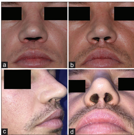
Figure 1: Nasal columella defect associated with a large, contiguous septal perforation after cocaine-induced nose destruction, in a 32-year-old male patient. Nasal tip projection was preserved. (a) Cosmetic result six months after columella reconstruction with a philtrum-based skin flap. (b) Aesthetic outcome two years after surgical reconstruction in profile (c) and worm's-eye view (d) Tip projection is preserved; no upper lip protrusion is noticeable

Defects of nasal columella can be repaired using skin grafts, composite grafts or several flaps including nasolabial,