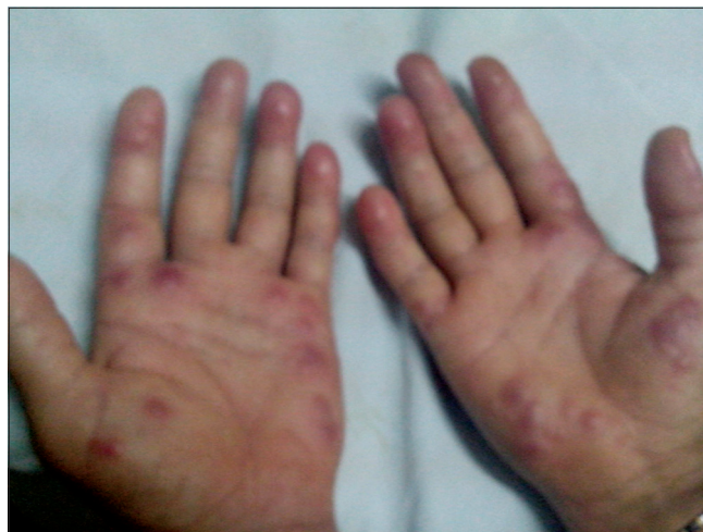
Figure 2: Inflammation of the digits (dactylitis) involving the patient's hands