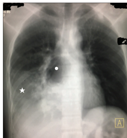
Figure 1: A posteroanterior chest radiograph showing a hyperlucent posterior mediastinal lesion (white dot) with an air-fluid level and consolidation of the lower lobe of the right lung

with an air-fluid level with opacities involving the lower zone of the right lung [Figure 1]. The previous records