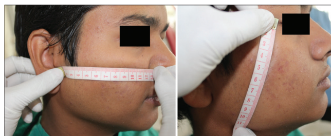
Figure 2: Photograph showing horizontal and vertical measurement of face

The facial measurement was made preoperatively and on the 1 st , 3 rd , and 7 th days postoperatively. The measurement of swelling was determined by subtracting postoperative facial measurement from preoperative facial measurement