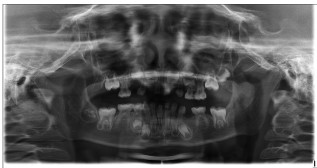
Figure 4: Panoramic X-ray showed multiple permanent tooth germs (#12, #14, #15, #17, #22, #25, #34, #35, #37, #45) and four primary teeth (#52, #54, #62, #74) congenitally missing