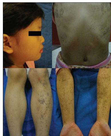
Figure 1: Patient presented a straight lateral profile. Whirling-like pigmented lesions over trunk and four extremities

This girl had symmetrical facial appearance with straight facial profile [Figure 1]. On intraoral photography, this girl demonstrated that bimaxillary incisors were in the relationship of crossbite with acceptable oral hygiene with healthy gingiva condition [Figure 2]. Bilateral lower primary incisors were shedding, and proximal caries were noted between upper left primary molars. A primary dentition with generalized spacing and four primary teeth congenitally missing (#52, #54, #62, #74) were demonstrated on periapical and bitewing X-rays [Figure 3]. Multiple permanent tooth germs (#12, #14, #15, #17, #22,