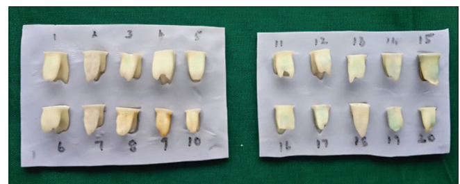
Figure 1: Arrangement of samples in vinyl polysiloxane impression material template for spiral computerized tomography scanning

The samples of Group 1-5 were mounted in vinyl polysiloxane impression material template (Express™ XT Putty Quick, 3M ESPE Germany) and were arranged by placing the mesial surface on the right side so as to maintain uniformity in all samples [Figure 1]. The samples were then subjected to light speed plus SCT scanner (GE Electricals, Wilwaukee, USA) in axial, coronal, and sagittal plane by an experienced operator. Volume rendering and multiple planar volume reconstruction for root canal