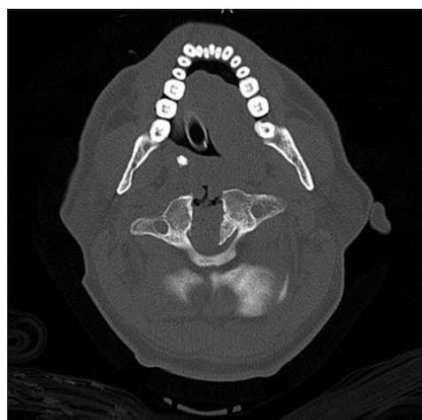
Figure 4: Postoperative computed tomography scan showing removal of most of the transverse ligament

Due to the main bulk of the ossified ligament seen anterior to the cord as well as the anterior compression of the cervical spine, we opted for an anterior approach as opposed to a posterior or 360 approach. Our patient and his family were kept in confidence that there may be a need of another procedure if complete debulking could not be done anteriorly.