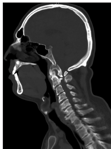
Figure 2: Computed tomography scan, sagittal image showing pseudoarthrosis of atlas along with ossification of longitudinal band of cruciform ligament