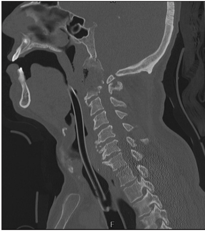
Figure 5: Postoperative sagittal image revealing excision of pseudarthrosis bone and ossified longitudinal band

Clinically, the disease presents as neck pain, stiffness, and features of myelopathy. [10] Treatment is controversial and should be tailored to the severity of the patient's presentation. Wang et al. [5] reported success with conservative therapies such as hard collar and halo ring traction. Others favored surgical decompression.