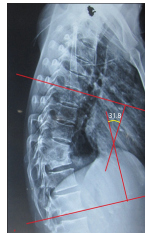
Figure 2: Cobb’s method of measurement of kyphosis

Patients operated by this technique were placed in the right or left lateral decubitus position based on the position