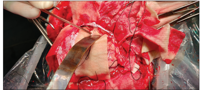
Figure 2: Intra-operative pus from frontal abscess in subfrontal approach

There are several predisposing factors of brain abscess such as immunocompromised state, preexisting medical