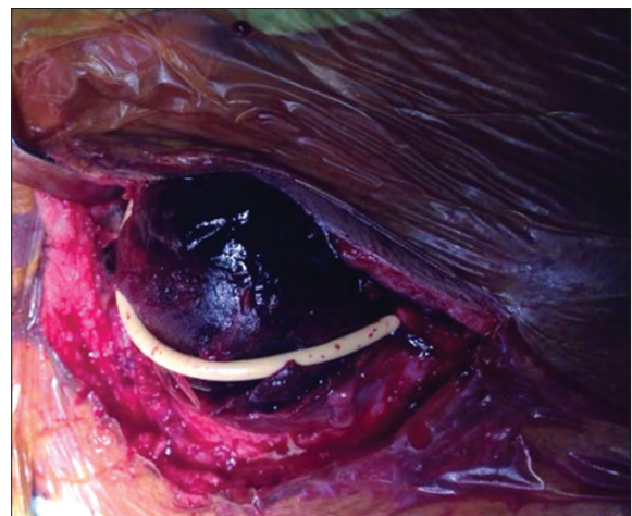
Figure 3: Operative picture of the occipital artery aneurysm distorting and pushing the shunt distal catheter (white) away of its course explaining shunt malfunction