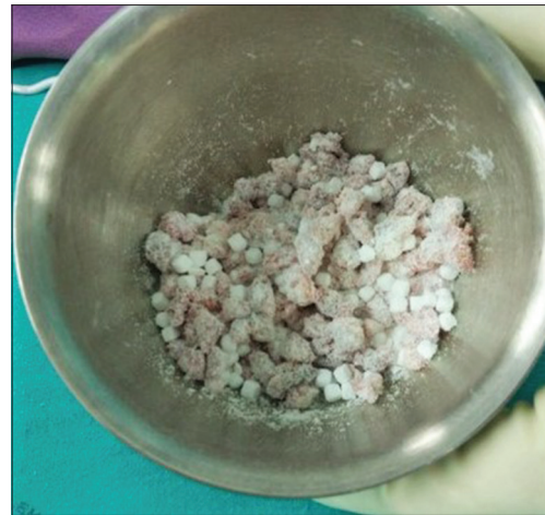
Figure 1: A half of vancomycin powder mixed with autogenous bone graft