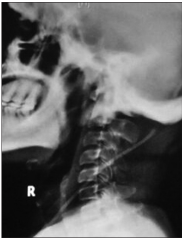
Figure 1: X-ray craniocervical junction showing straightening of cervical lordosis