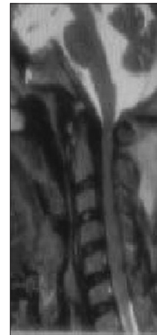
Figure 4: Magnetic resonance imaging cervical spine, T2-weighted, sagittal section image, showing severe spinal stenosis extending from C1 to C6 level