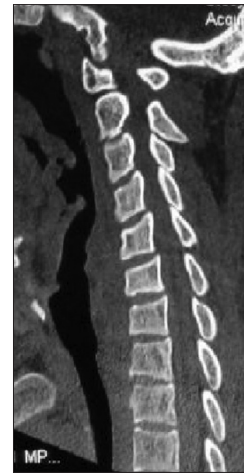
Figure 2: Computed tomography, of cervical spine, sagittal section image showing cervical canal stenosis