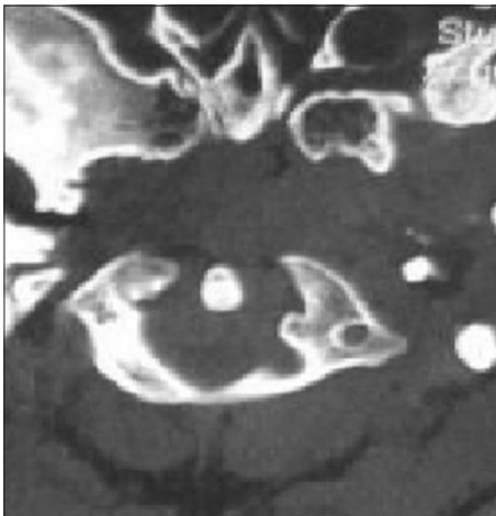
Figure 3: Computed tomography–cervical spine, axial section image showing cervical canal stenosis at first cervical vertebra level