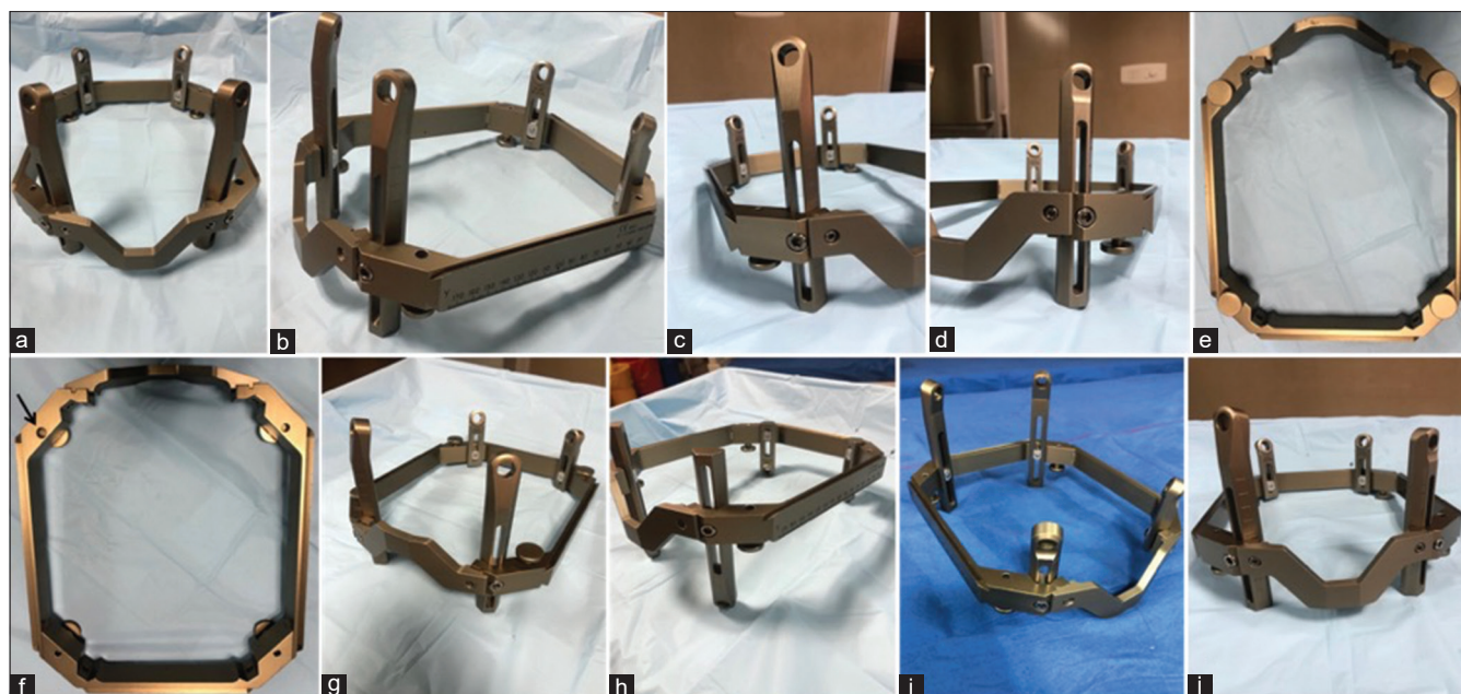
Figure 1: (a-c) Correct orientation of the frame and pillars; (d) wrong placement of straight long pillar anteriorly; (e) the view of the lower part of the base frame; (f) largest hole on the left anterior corner of the upper surface of the base frame; (g-j) different possible combinations of the wrong frame preparation