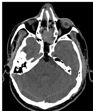
Figure 2: Postoperative axial brain computed tomography