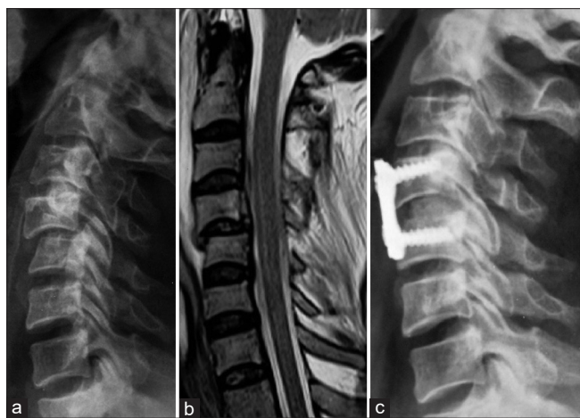
Figure 1: Images after the initial injury (a) X-ray cervical spine (lateral) showing a C4 on C5 subluxation; (b) T2 sagittal image showing dislocation with no cord signal change and (c) postoperative X-ray showing reduction with C4–C5 fixation with anterior cervical plate and screws with an interbody graft

Most patients would be careful after recovery from spinal injury. However, our patient was clearly a case of “once bitten, still not shy” and 4 years later (at the age of 57 years) he presented with a history of fall while trying to climb a moving bus and lost power in both lower limbs,