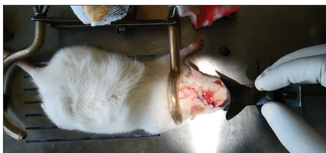
Figure 1: Custom-made autoclave abled table with clamps to position the animal

The introduction of osmotic agents in the treatment of raised intracranial pressure (ICP) was initiated by experiments of Weed and McKibben in 1919 which showed the ability of intravenous hypertonic solutions to acutely lower ICP. During the 1960s and 1970s, hypertonic urea and glycerol were widely used, but in recent years,