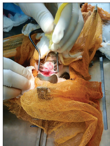
Figure 4: Irrigation fluid being suspended over the site of durotomy