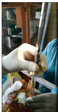
Figure 3: Contusion device for the weight to be dropped at the exact site from the exact height