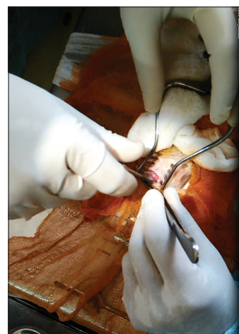
Figure 2: Burr hole being made over the frontal region