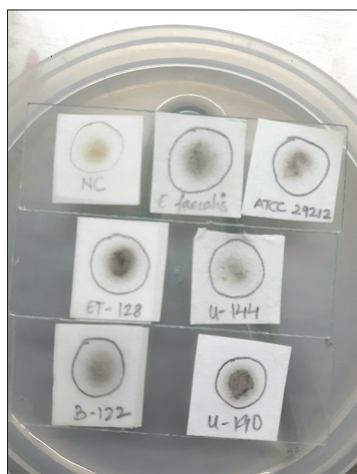
Figure 2: Sodium chloride-esculin spot test. Filter paper impregnated with sodium chloride-esculin solution and placed on a standard microscope slide. Top slide: Negative control used is Staphylococcus aureus . Positive control used are Enterococcus faecalis ATCC® 29212™ and a known Enterococcus faecalis (VITEK 2 systems identified). 2 nd and 3 rd slide: Positive reactions are indicated by the inoculation spot turning black 30–60 minutes later

In univariate analysis, risk factors for colonization or infection by enterococci were in patients with bacteremia, skin and soft-tissue infections, indwelling intravenous