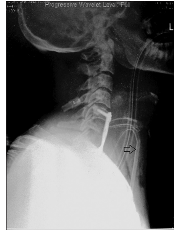
Figure 2: Lateral cervical X ray showing surgical dra

Airway obstruction within hours of tracheal extubation may be related to residual neuromuscular blockade or hypoventilation from narcotic medication. [1,2] In our case this probability was ruled out as the patient had a stable course for initial 6 hours postoperatively. Upper airway compromise in the immediate postoperative period (within 12 hours) following ACDF surgery mostly occurs due to an expanding wound hematoma. [1] But, in our case the suture line was intact, with no