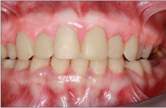
Figure 3a: Postoperative frontal view after one year

Full-mouth rehabilitation of an adult with amelogenesis imperfecta can be demanding. It requires better treatment planning and patient communication before commencing restorative treatment.