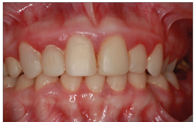
Figure 2b: Frontal view of final restorations