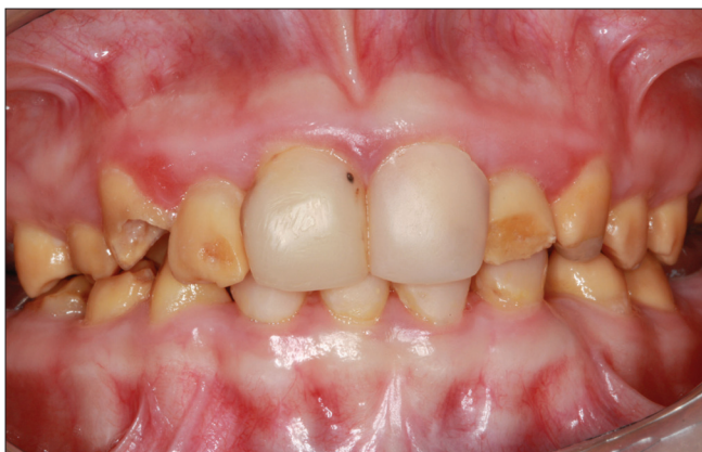
Figure 2a: Frontal view after finishing orthodontic treatment