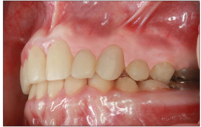
Figure 3b: Postoperative sagittal view after one year

In spite of considering the indication of porcelain or composite laminate veneers at the aesthetic restoration of anterior teeth, the dentist should also consider the cost, retention and technical accuracy between the two options. [12]