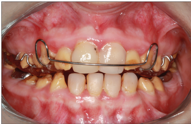
Figure 1a: Patient's intra-oral view with removable orthodontic appliance

The unfavorable effects of amelogenesis imperfecta on aesthetic appearance, function, occlusion, phonation, and the health of the gingiva necessitate different approaches from traditional dental treatments. [7]