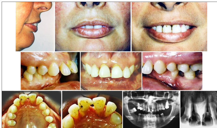
Figure 1: Pre-treatment photographs and radiographs

The patient underwent complete periodontal therapy, including plaque control, root curettage, and root planning. After periodontal disease control was achieved, a non-torqued, non-angulated 3M-Unitek, Dyna Lock 0.022 × 0.028-in slot brackets were bonded. The alignment and leveling was performed with 0.012, 0.014, 0.016, and 0.018-in stainless steel arch wires. After leveling, the maxillary incisor step down bends using a 0.020-in stainless steel arch wire were placed distal to the lateral incisor brackets to perform the orthodontic extrusion. The degree of each step of activation was on the order of 0.5 mm was established to guarantee the delivery of light and continuous force to the periodontium and to perform a gentle orthodontic extrusion [Figure 2].