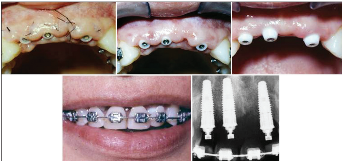
Figure 3: Implant placement and provisional anterior restoration

Augmentative surgical procedures are often used to improve the hard and soft tissue profiles of implant