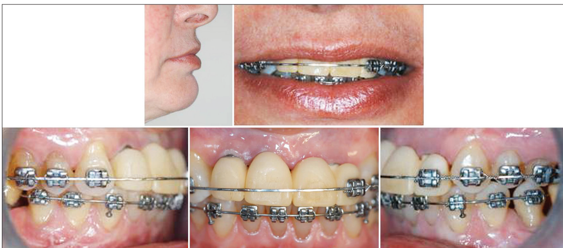
Figure 4: Finishing after mandibular surgical advancement