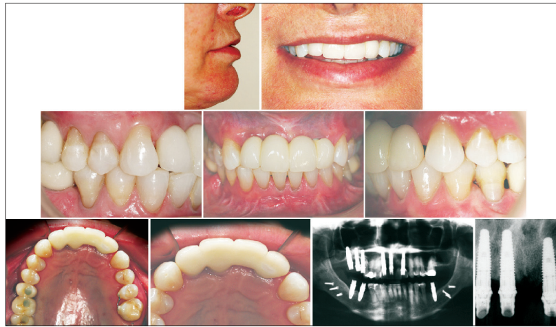
Figure 5: Post-treatment photograph and radiograph

recipient sites. Allogeneous grafting and autogenous bone grafting from intraoral or extra oral donor sites is currently the most widely used and best studied method of increasing the amount of alveolar bone available for primary implant anchorage, stability, and thread coverage. [1,13]