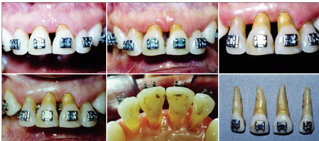
Figure 2: Extrusion with 0.020-in stainless steel arch wire and 0.5 mm step down between the lateral incisor and canine until final extraction