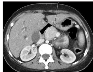
Figure 1: Prechemotherapy contrast-enhanced computed tomography scan showing, enhancing mass in the head of pancreas causing dilatation of the pancreatic duct, Common bile duct and the intra hepatic biliary tree

She was asymptomatic and her disease was under control until April 2011 when she developed nausea, vomiting and rapidly progressive jaundice. On investigating, the serum(S) bilirubin levels were 34 mg/dl with predominant direct-bilirubinemia, S transaminases (serum glutamic oxaloacetic transaminase/serum glutamic pyruvic transaminase) levels were 238/100 units/liter and S alkaline phosphatase was 1440 units/l. Contrast-enhanced computed tomography (CECT) scan demonstrated an irregular hypodense mass located at the head of the pancreas with dilatation of the common-bile-duct and intrahepatic-bile-ducts;