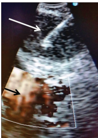
Figure 1: The image shows needle inserted in subcarinal lymph node under ultrasound guidance (white arrow) and vascular structure detected by Doppler (black arrow)

A study comparing EBUS guided TBNA with Mediastinoscopy enrolled 153 patients and found excellent agreement between both techniques in 91% of patients and similar sensitivity