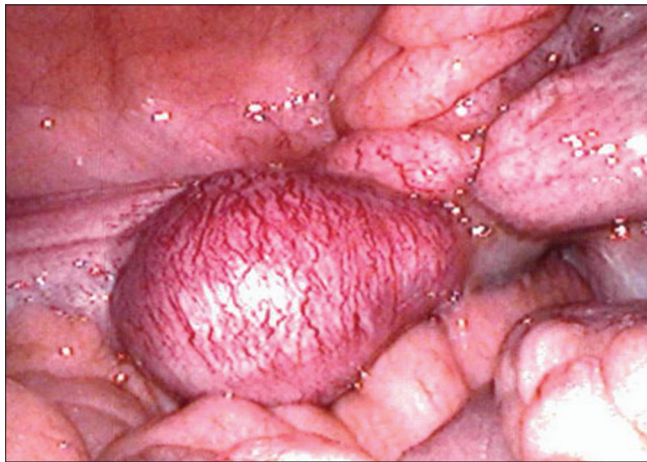
Figure 2: Laparoscopy showed a cystic mass attached to the urinary bladder and the right inguinal area