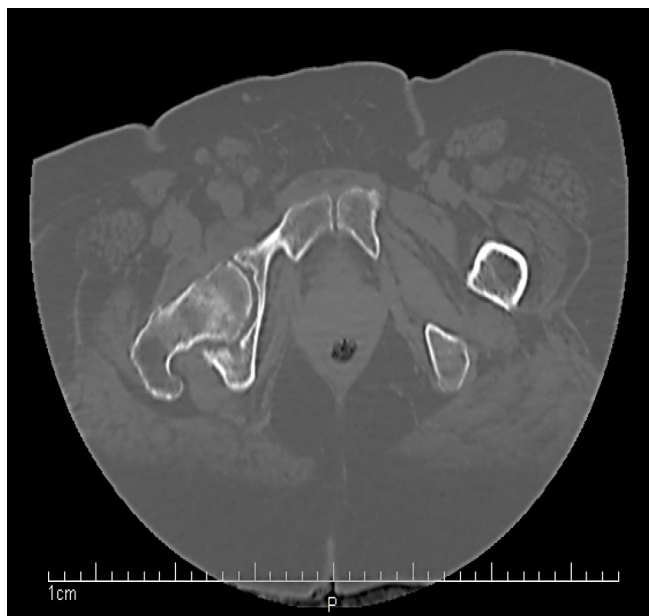
Figure 2A. Axial CT scan of the pelvis without contrast: advanced degenerative changes in both hip joints with partial resorption of both femoral heads worse on the left. No fracture was noted