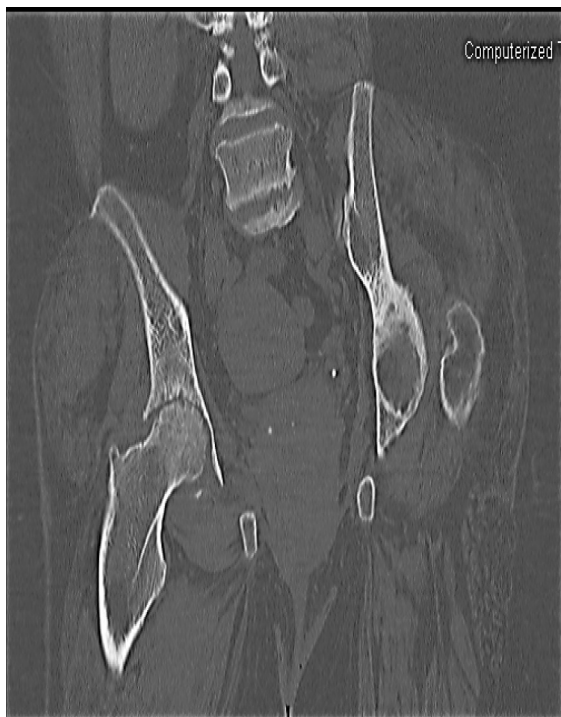
Fig. 3 B Coronal CT scan of the pelvis without contrast: advanced degenerative changes in both hip joints with partial resorption of right femoral head

years history of seropositive rheumatoid arthritis (RA), hypertension and congestive heart failure (systolic dysfunction with an ejection fraction [EF] of 25-30%) presented to the emergency department (ED) with community acquired pneumonia. Rheumatology service was consulted for untreated RA. Patient had been treated for RA with non-steroidal anti-inflammatory drugs (NSAIDs), prednisone 20mg daily and gold injections for 3 months about 30 years ago. Since then she stopped taking any medications other than over the counter NSAID. She was complaining of aching pain in the hands and hips when trying to move. Patient reported no history of recent trauma or use of DMARD (disease modifying anti rheumatic drugs) or corticosteroid. She has been a wheel chair-bound for the last 14 years due to severe limitation of joint movements and chronic aching pain in the hips and knee bilaterally that started to worsen progressively in the 4-5 years prior to being in wheel chair. She had morning stiffness of over 30 minutes. Patient denies any fever, chest pain, or skin rash.