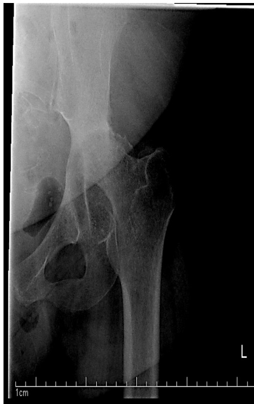
Figure 1B. Single AP view Xray of the left hip: Nonvisualization of the left femoral head which represent resorption of the femoral neck.

A 54-year-old African American female with a 30