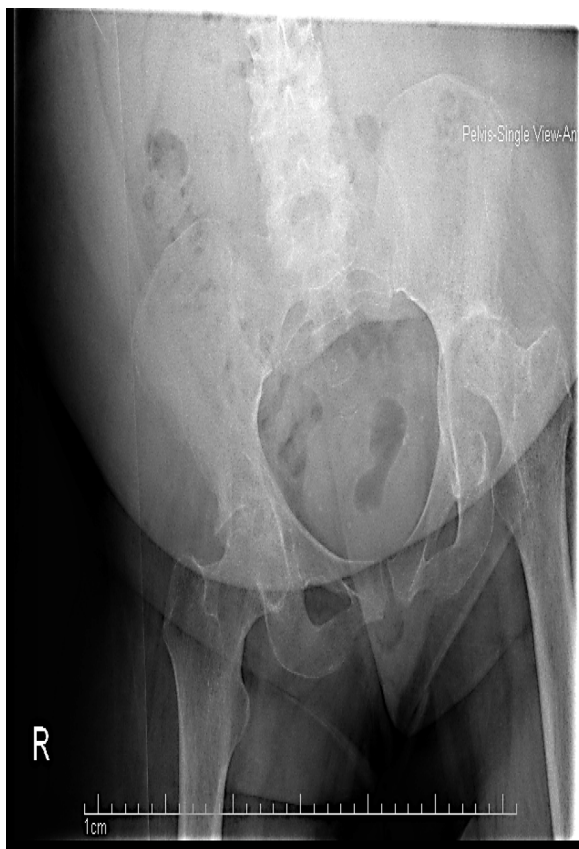
Figure 1A. Single AP view Xray of the pelvis showing non visualization of the right and left femoral head attributed to resorption of the femoral neck. Marked subcondral sclerosis in the acetabulum bilaterally.