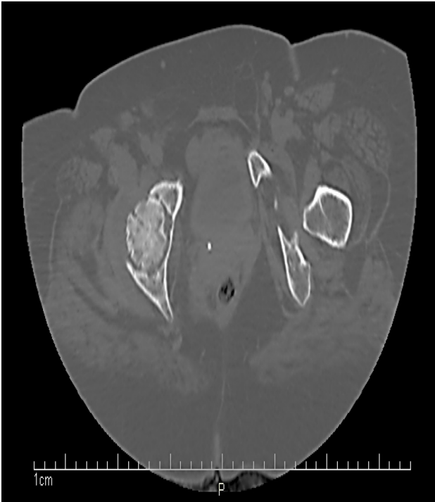
Figure 2B. Axial CT scan of the pelvis without contrast: resorption of both femoral heads with advanced degenerative changes in the form of subchondral sclerosis and subchondral cyst formation in both acetabular and femoral head suggestive of advanced degenerative changes