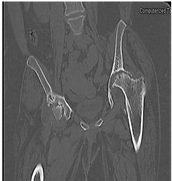
Figure 3A. Coronal CT scan of the pelvis without contrast: advanced degenerative changes in both hip joints with partial resorption of both femoral heads worse on the left, no fracture was noted