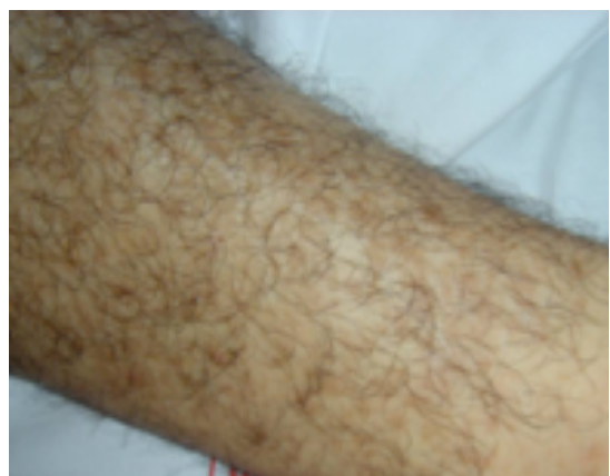
Figure 1. Skin lesions as seen in the upper chest, around umbilicus and legs.