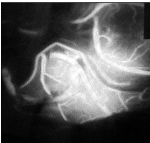
Figure 3: Intra operative ICG angiography after superficial temporal artery to middle cerebral artery anastomosis showing a patent bypass

The reliability of ICG VA in detecting stenosis and nonfunctioning bypasses has already been reported. [31,43,48] Its usefulness has been proved in high flow bypass also. [48] Because of its high image quality and spatial resolution, it will help not only to judge the graft flow but also the anatomical relationships at the anastomotic site. Takagi et al. , [43] also reported the usefulness of ICG VA in superficial temporal artery to middle cerebral artery bypass. The findings of ICG VA were positively validated during the post operative period by performing DSA or CT angiography. [31] The patency rate of EC-IC bypass, which was below 90% previously, has now become 100% with the usage of ICG VA. [48]