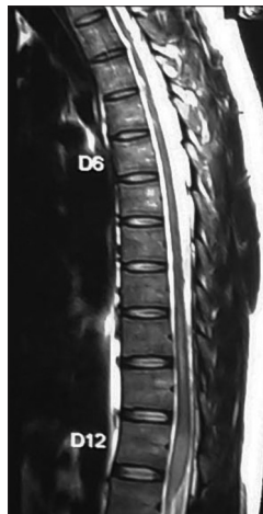
Figure 1: Magnetic resonance imaging of dorsal spine showing central T2 hyperintensities of the cord

Pang and Pollack have classified SCIWORA into four groups on the basis of age. [11] The adult group (16–45 years old) under which the patient in this case falls, is known to have a low incidence rate of SCIWORA while it is commonly seen in the pediatric population. The higher incidence of SCIWORA in children has been attributed to the inherent soft tissue elasticity of spine in children. [12] There is a decrease in elasticity of the spine as the child grows leading to higher incidence of bony fractures in adults. Another hypothesis states that SCIWORA is caused by the differential stretch of the spinal cord and the spine. Besides these, there are vascular and concussive hypotheses, but they lack accurate evidence. [12] While most of the SCIWORA cases are accounted for by cervical