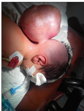
Figure 2: Preoperative picture of the same patient showing massive occipital encephalocele