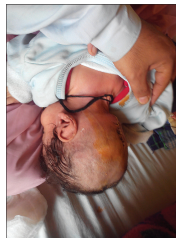
Figure 3: Postoperative picture of the same patient after resection of the encephalocele

patients (4%) diagnosed with Dandy–Walker cyst. 3 (6%) patients were suspected developmental delay and mental disorders. Eight (15%) patients also had seizure. None of the patients had neurological deficits in our study. Some of the swellings gradually increased in size from birth, while others remained static, or even decreased [Table 2].