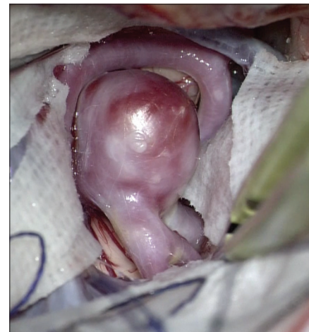
Figure 2: Intraoperative image of the same aneurysm with thinned wall