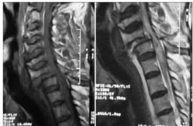
Figure 1: Magnetic resonance imaging cervical spine, mid-sagittal images showing a subluxation at C5/C6 level with normal images on T1 and central hypointensity with peripheral hyperintensity on T2-weighted, which was considered in contusion group

Descriptive analysis of all explanatory variables and outcome variables was done. Sociodemographic variables such as age, gender, and clinical parameters such as the site of spinal injury, number of segments involved, and MRI findings were considered as explanatory variables. Clinical improvement and FIM score were taken as outcome variables. The association between the explanatory variables and outcome variables were assessed by calculating appropriate parameters such as odds ratio, mean difference, and percentage differences. P values, 95% confidence intervals were assessed by appropriate statistical tests like Chi-square test, t -test, or regression analysis. IBM SPSS Statistics for Windows, Version 21.0. Armonk, NY: IBM Corp. was used for statistical analysis.