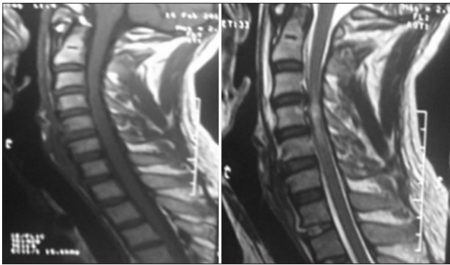
Figure 2: Magnetic resonance imaging cervical spine, mid-sagittal images with normal imaging on T1 and hyperintense on T2-weighted sequences, which was considered as edema group