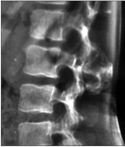
Figure 1: Plain roentgenogram shows approximation and adhesion of the spinous processes of L1-L2 vertebrae