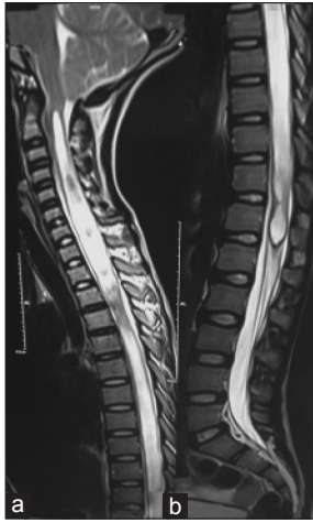
Figure 1: (a,b) Sagittal T2-weighted images show herniation of peg-shaped cerebellar tonsils 8 mm below the level of the foramen magnum with mild expansion of cervical spinal cord with hydrosyringomyelia and extension upto upper border of L1