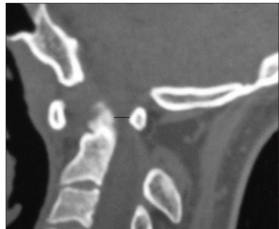
Figure 2: CT CVJ showing method to calculate ECD