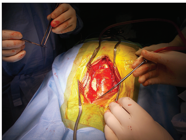
Figure 4: Cyst being removed