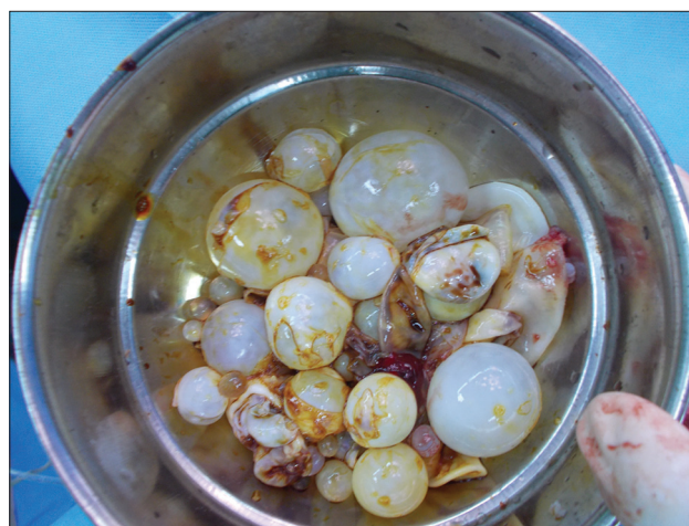
Figure 5: Removed cysts

column is involved in 0.2-1% of all patients, of which spine is involved in approximately 45% of cases. [1,2] The thoracic vertebrae are commonly involved and the involvement of cervical, lumbar vertebrae, and sacrum is rare. [3-5] However, it remains controversial as to which region is more commonly involved. Spinal hydatid disease causes symptoms and signs related to compression of the cysts on other structures, no specific pathognomonic symptoms or signs exist. [8] Usual presentation is radiculopathy, myelopathy, and/or local pain owing to bony destructive lesions, pathological fracture, and consequent cord compression. [1] Hydatid cysts of the sacrum are characterized by chronicity without any clinical manifestation and usually misdiagnosed in the early stage, resulting in significant loss of bone and destruction of surrounding tissue. [9] Sometimes the spinal hydatid cysts can grow to enormous size and remain asymptomatic for years. [1] Routine laboratory tests do not show specific values. Eosinophilia is mostly limited (<15%) or absent. In spinal involvement, the serological sensitivity of antigens is 25%. [10]