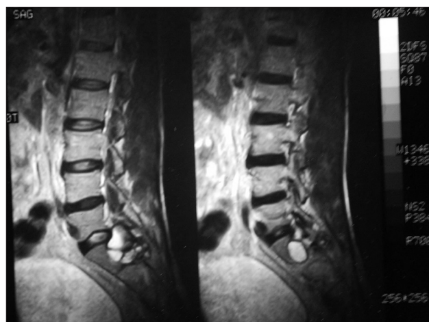
Figure 1: Hydatid cyst in sacrum (13 years back)