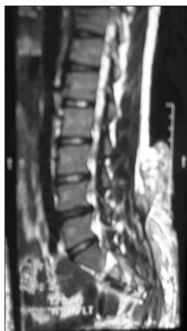
Figure 1: Sagittal T1-weighted magnetic resonance image showing lipomyelocele in the lumbosacral region and disruption of the overlying bony elements