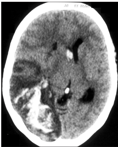
Figure 1: Plain axial CT scan shows a large right sided temporo-parieto-occipital hypodense area with foci of hyper attenuation within, suggestive of hemorrhagic transformation. The right lateral ventricle is effaced and there is evidence of subfalcine herniation and midline shift

Her thrombophilia profile which was sent on admission indicated low levels of Protein S and Antithrombin (AT) III. Other parameters were normal [Table 2].