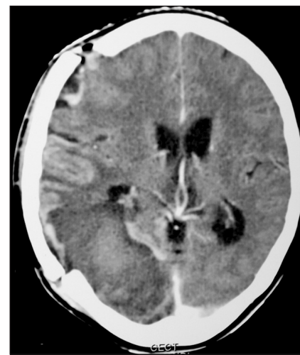
Figure 2: Post contrast axial CT scan on post operative day 5 showing extensive leptomeningeal and peripheral enhancement of the infarct. The mass effect has decreased but the occipital horn is still mildly effaced