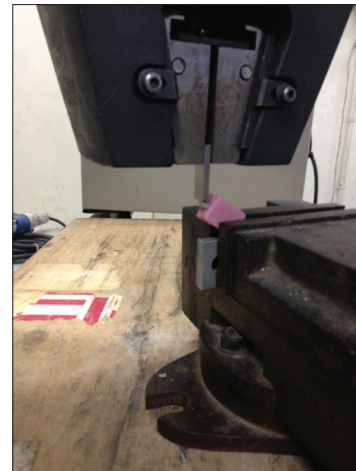
Figure 4: The acrylic block loaded in universal testing machine at 148° angulation

was done with the help of universal testing machine (Instron). The acrylic resin block mounted with tooth was subjected to compressive load at the angulation of 148° at the speed of 0.5 mm/min. The maximum load at which the tooth fractured was recorded in Newton. Fracture at any point of the sample was recorded as failure of the post system [Figure 4]. The entire procedure was done by a single operator.