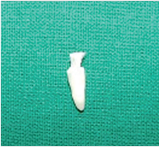
Figure 1: Ribbond post luted with dual cure composite