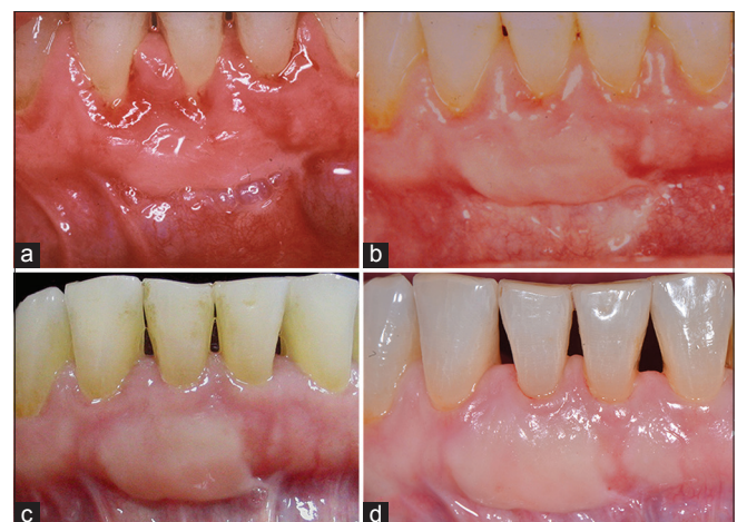
Figure 2: Postoperative clinical views at (a) 1 month (b) 6 months, (c) 2 years, (d) 12 years