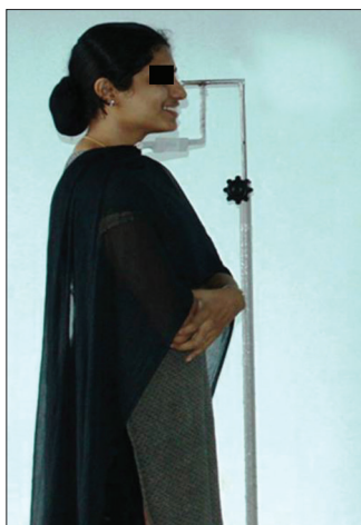
Figure 1: A scale mounted on an adjustable stand was positioned horizontally below the mandible

Sn-Me' distance was measured by hanging a vertical string with a weight (subject in natural head position), and these points were marked accordingly on the string. The marked distance is measured as the true vertical distance between Sn and Me' using digital vernier caliper. The subjects were videotaped on the same day as the measurement of LFH was taken. Both the measurements were taken by a single trained rater (principal investigator). LFH and posed SW were calculated again on 20% of the sample population and reliability of the measurements was assessed.