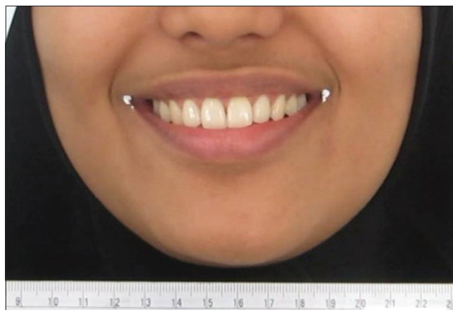
Figure 2: Posed smile photograph (obtained from video clip using free studio software)

The results were expressed as mean and SD; the mean lower facial height of females was 62.82 mm with an SD = 3.112. The mean lower facial height of males was 69.23 mm with a SD = 2.276. The difference between the above two means was significant with a t = 10.231 and P = 0.000 [Table 1]. The mean posed SW of females was 64.59 mm with the SD = 3.706. The mean posed SW of males was 69.34 mm with the SD = 3.718. There was statistically significant difference between the mean posed SW of males and females with a t = 5.653 and P = 0.000 [Table 2]. The co-relation between posed SW and lower facial height [Table 3] was done, and a statistically significant ( P < 0.01 ) result was obtained. The scatter diagram also shows this positive co-relation [Diagram 1]. The ratio of lower facial height and posed SW was calculated