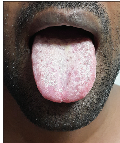
Figure 1: Diffuse loss and atrophy of the filiform papillae on the dorsum of tongue

A 26-year-old unmarried male reported to the outdoor Department of Oral Medicine and Radiology with a 2-week history of burning sensation and redness of tongue with altered taste acuity. Oral examination of the patient revealed diffuse loss and atrophy of the filiform papillae on the dorsum of the tongue with insignificant changes of the oral mucosa [Figure 1]. Extraoral examination at this time was insignificant. A provisional diagnosis of erythematous candidiasis was made, and the patient was prescribed clotrimazole 1% weight/volume thrice a day for 1-week. [5] Five days later, the patient returned without any resolution of the tongue lesions and neither any improvement of the burning sensation. Furthermore, he complained of systemic symptoms of lethargy, malaise, mild fever and difficulty in swallowing along with psoriasiform scaly lesions on the palms and soles and few violaceous plaques on the body. Detailed intraoral examination disclosed that the lesions of the tongue had extended into pharynx portraying a picture of oropharyngeal candidiasis. This raised suspicion and on further