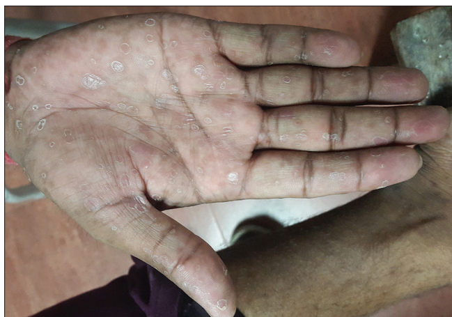
Figure 2: Psoriasiform scaly lesions of the palm

kidney function tests were all within normal limits. Peripheral blood CD4+ T cells counts of the patient were 737 cells/mm 3 .