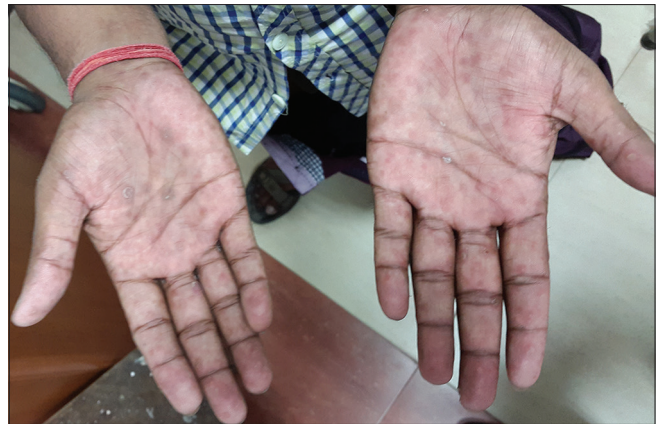
Figure 5: Significant resolution of clinical lesions at the end of 2 weeks

stresses the importance of diagnostic and therapeutic implications when patients present with such puzzling plethora of manifestations, which can baffle even the most trained eye and when the stakes are too high.