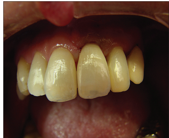
Figure 7: Loaded temporary crown