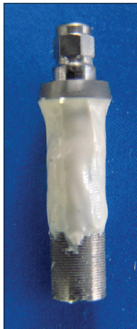
Figure 4: Abutment with opaque resin

Manufacturing a temporary tooth using the natural surface of the extracted tooth was a simple, fast,