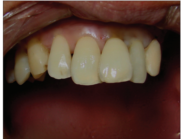
Figure 1: The patient immediately after periodontal treatment

was correctly positioned on the dental arch, the resin was polymerized. The assembly (surface and temporary abutment) was removed [Figure 5], and a photopolymerizable resin was filled into the space between the surface and metallic cylinder to establish