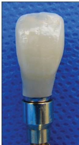
Figure 6: Temporary crown