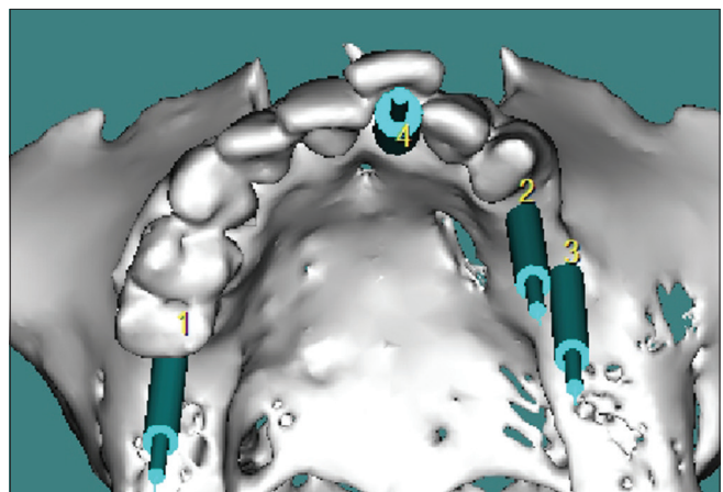
Figure 3: Virtual surgical and prosthetic planning