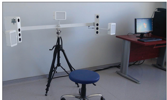
Figure 4: Stereophotogrammetry with 2 different coplanar planes for 3D images

Stereophotogrammetry includes photographing a 3D object from 2 different coplanar planes in order to acquire a 3D reconstruction of the images [Figure 4]. This technique has proven to be very effective in the face display. It mentions to the private case with 2 cameras, arranged as a stereopair, are used to recover 3D distances of features on the surface of the face. [72] The technique has been implemented clinically by using a mobile stereometric camera. [21] Contemporary stereophotogrammetry may be used to clear up accurate 3D skull mapping. In 1944, the