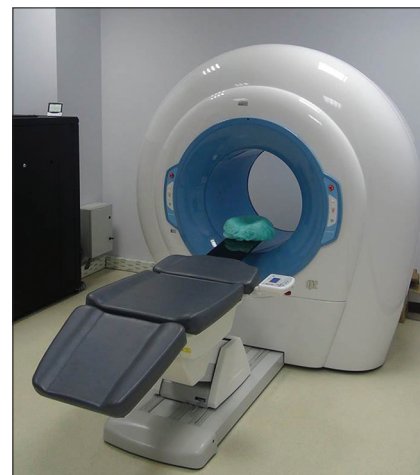
Figure 1: Cone beam computerized tomography for craniofacial imaging

With the cone-beam systems, dental therapists can achieve 3D (volumetric) data with very low radiation dose at one time. [43] At the same time, CBCT allows re-alignment of 2-dimensional images in coronal, sagittal, oblique, and various incline planes [Figure 2]. When we compare CBCT with CT, patients' visualization with less radiation dose is possible. [42,44] CBCT devices provide 15 times less radiation dose than conventional CT scanners do. The radiation dose of CBCT equals to a dose of average 12 panoramic radiographs. [11]