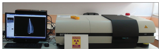
Figure 3: Micro-computed tomography for analysis of mineralized tissues with micro-sized sections

With the use of modern technology at X-ray sources and detectors, MCT devices have 10,000 times more resolution than medical CT scanners do. [61] The system has a micro focus X-ray source, a CCD camera, and a personal computer for control of the system. The X-ray radiation source with focal spot size of 10 mm is used to scan the objects. CCD camera provides high-resolution images. MCT gives important information about wound healing and micro vascular researches in orthopedics. The MCT devices are also used in researches related to endodontics, prosthetics, TMJ, and dental caries. [62,63] Current MCT scanning of bone has revealed accurate and precise information about