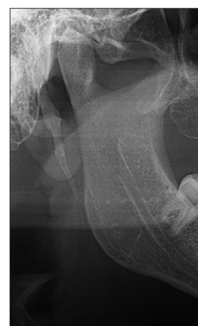
Figure 2: Type II: Pseudo articulated styloid process