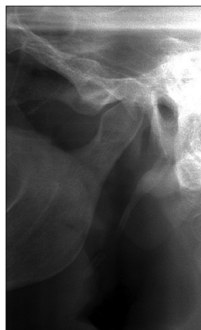
Figure 3: Type III: Segmented styloid process

the intraobserver variations, measurements were repeated after 1 month on a subset of 550 panoramic radiographs by the same observer. The deviation of the mean length of the styloid process between 1 st and