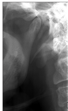
Figure 1: Type I: elongated styloid process